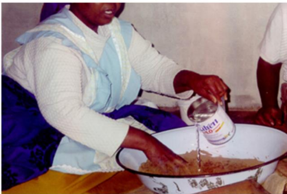
Snuff being prepared traditionally by women for a wedding ceremony in South Africa