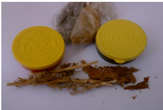
Two popular South African manufactured snuff brands in containers and traditional vendor/ individual-made snuff in plastic bags