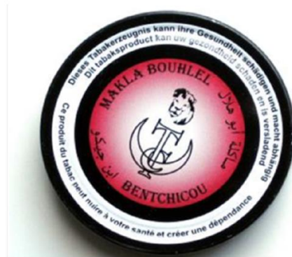
New commercial snuff brand on the Algerian market, imported from Belgium