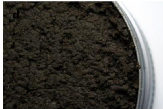
Contents of a can of a manufactured moist snuff brand—Makla Bouhlel