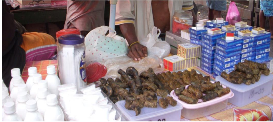
Figure 14-2. Pre-wrapped betel quids (areca nut, lime, tobacco, and betel leaf) on sale in a public market