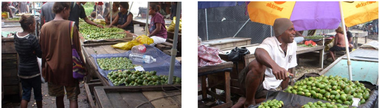
Figure 14-1. Areca nut being sold in markets in the Solomon Islands