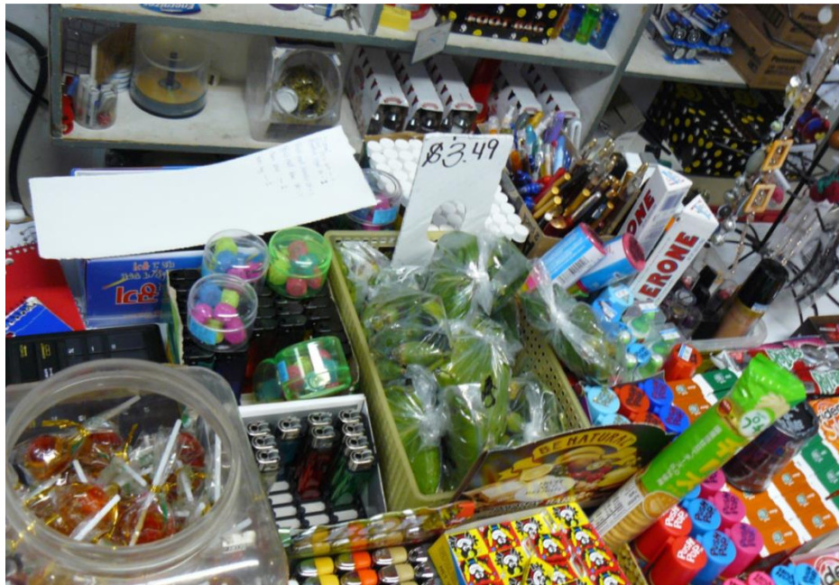
Figure 14-3. Wrapped fresh betel quids sold alongside cigarette lighters and candy in a Guam store