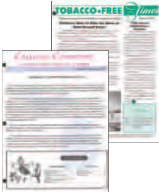
Newsletter covers from Kent County Health Department, Grand Rapids (MI) and Coalition for a Tobacco-Free West Virginia, Charleston (WV)

Because of the tobacco industry's determined efforts to undermine ASSIST and to prevent the states from conducting policy advocacy activities (described in chapter 8), some ASSIST personnel were extremely conservative in interpreting the federal policies restricting lobbying and even feared restrictions that were actually legitimate practices of policy support and advocacy. Some commissioners and legislative staff be-