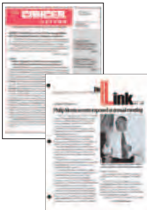
The Cancer Letter, a privately published newsletter (used with permission of The Cancer Letter), and The Link, published by Smokefree Indiana

among the states, the ASSIST Coordinating Center, and NCI staff. A number of subcommittees emerged to provide forums for discussion and to identify needs that NCI and the ASSIST Coordinating Center might address: the Program Managers Subcommittee, the Strategic Planning Subcommittee, the Research and Publications Subcommittee, the Technical Assistance and Training Subcommittee, and later the Multicultural Subcommittee. The ASSIST Coordinating Committee and its subcommittees were important linkages through which the states participated in project-wide decision making and shared issues of concern or interest with NCI staff. Also, they were a useful mechanism for com-