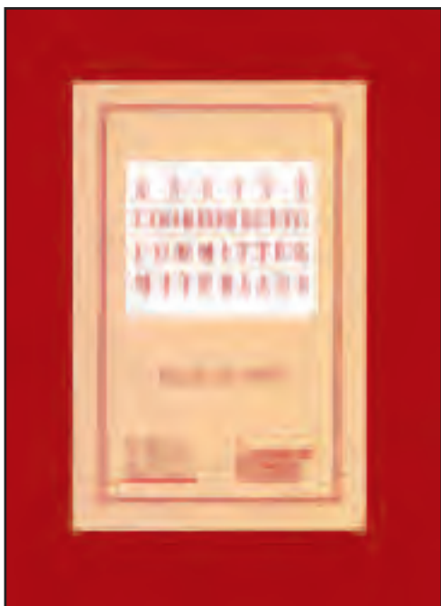
ASSIST Coordinating Committee Materials

ent, unified program. Achieving that cohesiveness was a challenge. The structural units of ASSIST were numerous, complex, and geographically distant, with the needs of the partners and coalitions evolving in response to unforeseen circumstances. By 1996, the 17 ASSIST states had 255 state and local coalitions with more than 2,900 members. 1 Linking all these units required clearly defined, effective systems of communications and decision making throughout the structure.