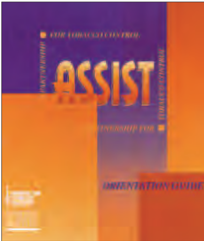
ASSIST Orientation Guide

level to mirror that of NCI-ACS at the national level. The national ACS office vigorously promoted this partnership with their state divisions. Although technically other primary partnerships were possible under the guidelines, all 17 state health departments in fact partnered with state divisions of ACS. Although slight variations existed, most states named a member of their state health department as a project director and a member of the state ACS division as a project manager. All state health departments and ACS divisions were linked to the national structure through the ASSIST Coordinating Committee. (See page 55.) In some instances, the health department ASSIST project director and the ACS project manager served as the state's representative to the ASSIST Coordinating Committee meetings, conference calls, and workshops. Directors and managers, along with their respective state project executive committees, oversaw the programs at the state level.