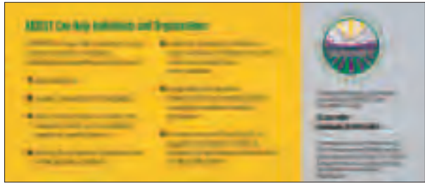
ASSIST informational brochure

level to mirror that of NCI-ACS at the national level. The national ACS office vigorously promoted this partnership with their state divisions. Although technically other primary partnerships were possible under the guidelines, all 17 state health departments in fact partnered with state divisions of ACS. Although slight variations existed, most states named a member of their state health department as a project director and a member of the state ACS division as a project manager. All state health departments and ACS divisions were linked to the national structure through the ASSIST Coordinating Committee. (See page 55.) In some instances, the health department ASSIST project director and the ACS project manager served as the state's representative to the ASSIST Coordinating Committee meetings, conference calls, and workshops. Directors and managers, along with their respective state project executive committees, oversaw the programs at the state level.