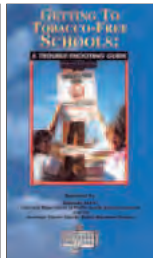
Materials and activities for tobacco-free schools in Colorado