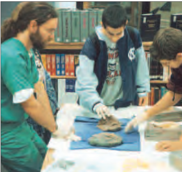
Students participate in a tobacco use prevention activity

By 1998, at least 75 percent of primary medical and dental care providers will routinely advise cessation and provide assistance and followup for all of their tobacco-using patients. 13(p3)