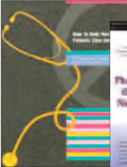
NCI manual for physicians