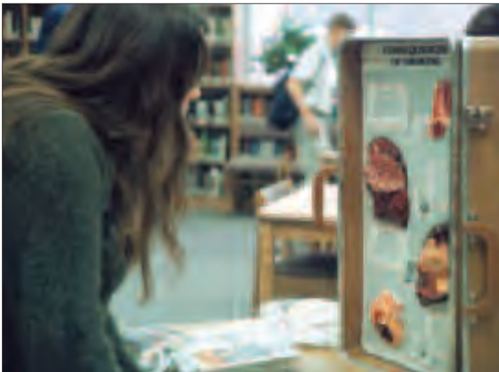
A student studies material on the consequences of smoking

The ASSIST funding itself, $140 million, seemed enormous at that time but would have been quickly depleted if the 17 ASSIST states were unconstrained in their use of the funds to develop and directly provide program services. The indirect approach to providing program services freed ASSIST funds to address