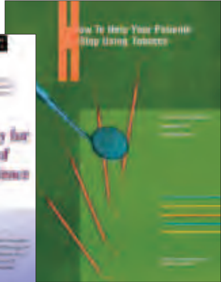
NCI manual for oral health practitioners

have been reported.” 20(p1) State ASSIST staff were encouraged to identify and train other health-care practitioners, such as public and occupational health nurses, dental hygienists, and pharmacists to conduct such interventions. 20 The “ASSIST Program Guidelines” also promoted the identification and training of individuals not in health-care roles who could deliver brief interventions supporting smoking cessation. Cessation aids such as print, video, or audio products as well as cessation materials tailored to the needs of a specific priority population (e.g., students) could be used by existing coalitions, organizations, agencies, community groups, and individuals who had access to the education community. This referral to cessation services through a cessation directory is another example of the marketing of