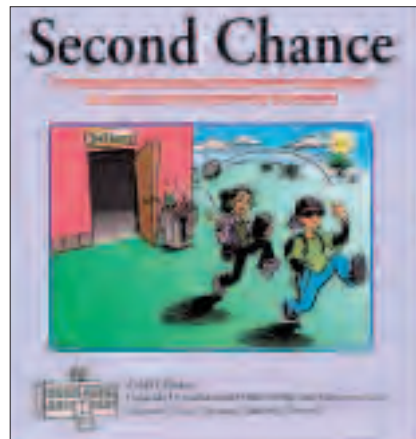
Self-directed tobacco use prevention program booklet used in Colorado