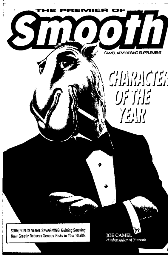
Figure 3 The "smooth character"

Perhaps the most criticized campaign of recent years was the introduction, in 1988, of the "smooth character" cartoon, Joe the Camel (Figure 3). In 1989, RJR Nabisco ran a particularly outrageous four-page ad in youth-oriented Rolling Stone magazine, in which dating advice was offered for young men. On the first page of the ad is a cartoon of a beautiful woman